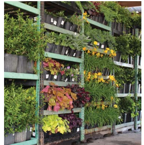
Ready for shipment

How long have you lived in the area? The May family can trace their roots back to the 1820's — that is almost 200 years! For four generations, they worked the land on shade tobacco farms. Over time, the family foresaw the U.S. cigar wrapper tobacco crops giving way to international growers. However, they did not give up — they just adjusted with the times. In 1971, they put their agricultural roots to work and converted the family shade tobacco farm to a nursery, which everyone knows today as May Nursery. For three generations, they have weathered ever-changing economic storms and become a market leader in the Southeast. They employ around 145 people, and someone can always be found working at the nursery. The nursery covers 450 acres, where you can find cold-hardy landscape shrubs, such as azaleas, junipers, roses, and much more. As they are always getting ready for the next crop, they have a perpetual revolving door of potted plants. Though most of their products are exported out of Florida, you can find some of their items locally at Tallahassee Nurseries or Esposito's. Thank you, May Nursery, for being a loyal Talquin Member and for making the world a beautiful place — one flower at a time.