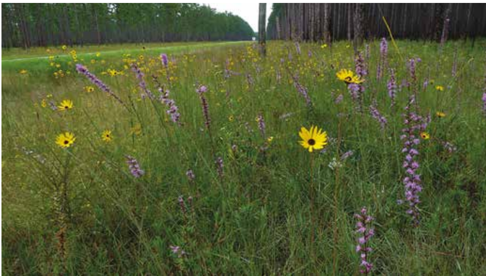
State Road 65, by Eleanor Deitrich

Remember to always call 8-1-1, Call Before You Dig, before you start any landscaping project.