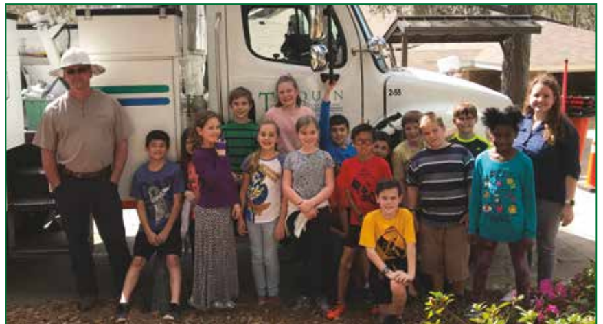
Thank you Community Christian 4th graders for having us out to learn about electricity!

Pine Trees – You Cut: 15 large pine trees, 2 medium pine trees. 524-3930 leave message