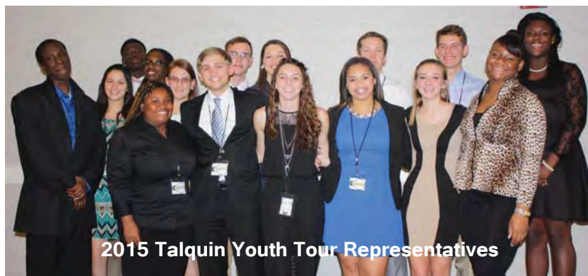
2015 Talquin Youth Tour Representatives

email alisia.hounshell@talquinelectric.com .